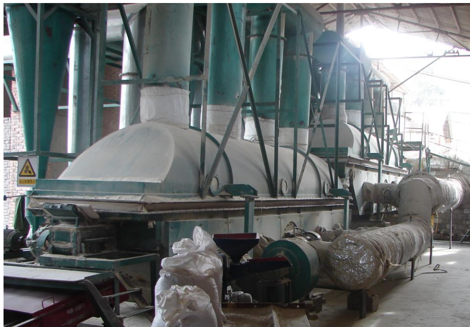
Figure 2: Dewatering and drying processes during the Phoslock ® manufacturing at Kunming factory, China.