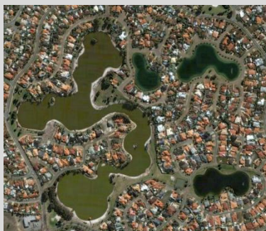
Figure 1: Aerial view of Emu Lake

Emu Lake was constructed from a natural swamp located in Ballajura in the City of Swan, Western Australia (Figure 1). It covers an area of approximately 10.5 ha (105,000 m 2 ) and is fed by stormwater runoff and groundwater from the Gngangara mound. Since its construction in 1980, the water quality in the lake has deteriorated with blue green algal blooms (particularly the toxic form of cyanobacteria) becoming more dominant in recent years.