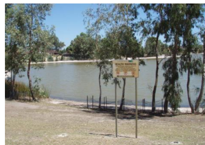
Figure 2: Emu Lake on 19 th January 2011

The manmade lake contains an organic rich peat layer about 1m below the overlying sand sediment. Sediment testing has shown that the phosphorus source into the lake is most likely from dissolution of P in the peat layer moving through the sand layer and into the water column during periods of sediment-water interface disequilibrium. Other sources of phosphorus contributing to the overall P budget are from direct inflow through drains and from groundwater interaction from the surrounding residential areas.