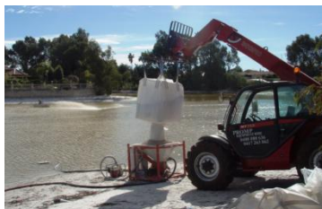
Figure 4: Phoslock delivered to hopper and then sprayed from boat in the June 2011 application.

the telescopic loader and placed on the pontoon, that was held in place manually.