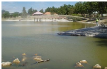
Figure 3: Phoslock applied to Emu Lake from the shore in the 2007 application.

A trial application of 7 tons of Phoslock were applied to 1/3 rd of the lake on 16 th /17 th April 2007 to reduce the phosphorus load. Phoslock was sprayed from the shore into the lake via a hopper that mixed the Phoslock and site water into a slurry. After the success of the trial 26 tons was applied to the whole of the lake between 3-7 th December 2007. On 9 th /10 th June 2011, a top-up application of 22.2 tons of Phoslock was applied to Emu Lake. The application consisted of a 3 stage strategy where the lake was segmented into 3 application zones. This allowed for accurate placement of the slurry using a combination of shore based and water based application. Due to access restrictions and prevailing winds, parts of the lake were accessible only by boat. For the boat application, bags of Phoslock were loaded onto the pontoon at the beach area. Pallets were lifted by